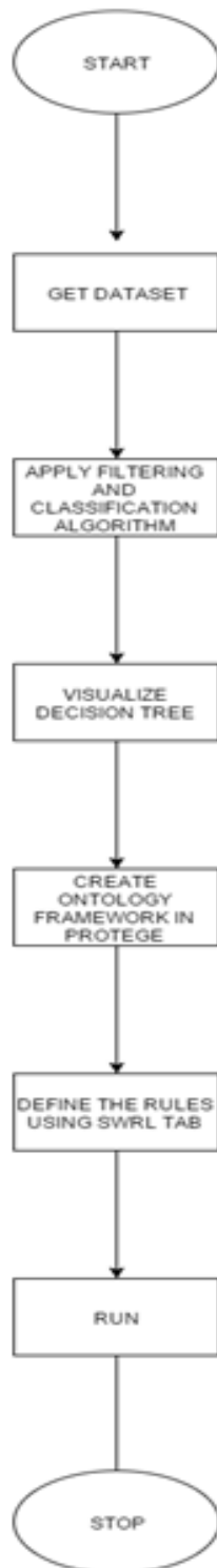
Fig 2. Flowchart for Graduate Prediction System